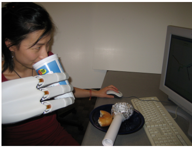
Fig. 1. Snapshot of our control system driving a DLR/HIT robot hand to assist a human eat a meal. The user selects points on the 2D control space displayed on the screen using the mouse.

Neurally controlled prosthetic devices capable of object manipulation have much potential towards restoring the physical functionality of disabled individuals. However, the number of user input variables provided by current neural decoding systems is much less than the number of control degrees-of-freedom (DOFs) of a prosthetic hand and/or arm. More specifically, efforts to decode user neural activity coming from feasible sensing technologies, such as electroencephalogram (EEG) [3] and cortical neural implants [4], [8], into control signals have demonstrated success limited to 2-3 DOFs with bandwidth approximately 15 bits/sec.